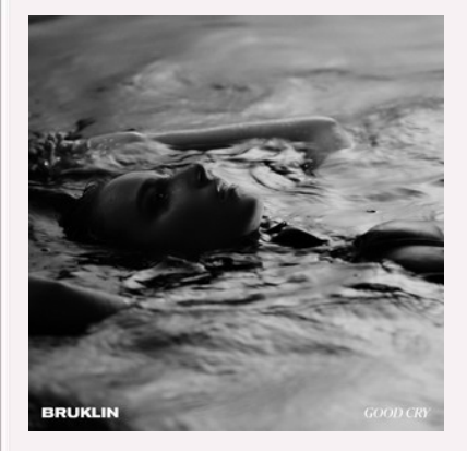
GOOD CRY (ACOUSTIC)